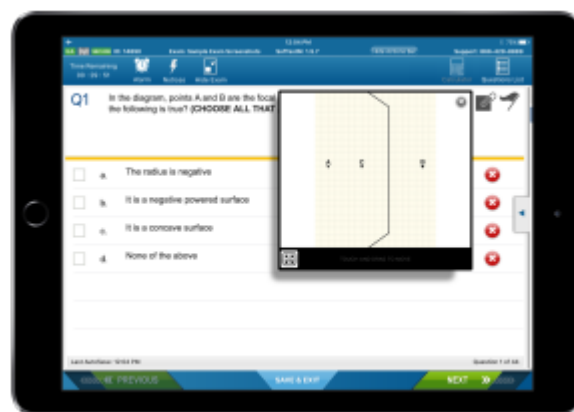
Image 2. A question attachment such as an image or diagram opens automatically when the question is opened. The image may obscure parts of the question text or answer choices, but it can be moved or closed and reopened as needed.

The greatest strength of SofTest-M that was mentioned in the free-response section of the survey was quickly receiving exam scores with detailed category reports ( Image 3 ). Faster scoring and more specific feedback are commonly mentioned benefits of computer-based assessments, 25,26 and Bennet 27 has cited these as important reasons that state education agencies are employing more online tests. At the NSU College of Optometry, Scantrons are scored using an external grading center, and any errors such as a mis-key can cause significant grading delays. ExamSoft, on the other hand, allows for direct control of the grading process with the ability to easily adjust and re-score items and assessments as needed. This has decreased the time it takes for faculty to distribute grades to the students. The ability to tag and categorize questions also enables the instructor to provide customized, detailed feedback regarding a student's performance ( Image 3 ) and can help guide the student in determining particular topics that need to be reviewed.