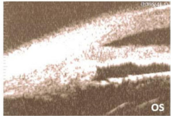
Figure 2. Ultrasound biomicroscopy of the left eye following argon laser peripheral iridoplasty.

The patient returned to the clinic as scheduled but presented to the visit with an injected left eye in conjunction with a mid-dilated pupil. When questioned he reported having four episodes of pain with blurring of vision in that eye since his last visit. The most recent episode lasted 10-12 hours, and his wife noted that his pupil was larger in the left eye. He reported that the symptoms were mitigated after going into the bright sunlight. The patient also noted strict adherence to administering 0.004% travoprost qhs OS. Visual acuity was stable at 20/20 OD and OS. Pupils were not equal. In dim illumination, the pupils were measured at 4.0 mm OD and 6.0 mm OS, and in bright illumination, 3.0 mm OD and 5.5 mm OS. Both eyes were round and reactive to light, but OD was more brisk with a grade 3+ response vs. a grade 1 response OS. No afferent pupillary defect was noted. Extraocular motilities and confrontational visual fields were full OU. Slit lamp examination was stable from last exam OD but revealed perilimbal flush OS. The anterior chamber was without cells and flare and the LPs remained patent OU. IOPs measured by Goldmann tonometry were recorded as 14 mmHg OD and 51 mmHg OS at 8:43 a.m. Sussman 4-mirror gonioscopy OS