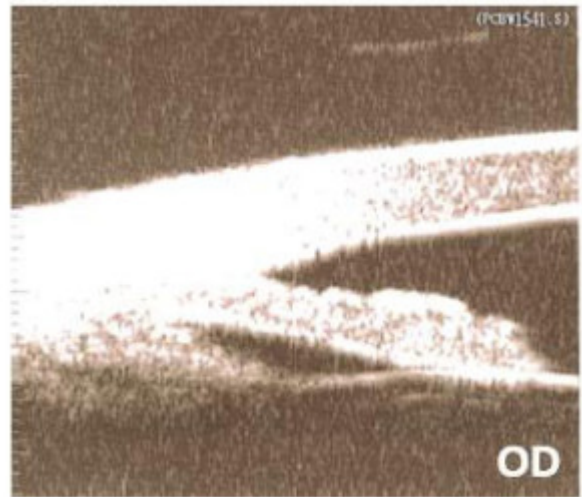
Figure 1. Ultrasound biomicroscopy of the right eye.

The patient returned to clinic two months later reporting more frequent episodes of blurred vision accompanied by periorbital pain OS. He noted that the symptoms were lasting up to three hours and felt that they were now occurring two to three times per week. The patient also realized that these symptoms typically occurred after waking in the morning or after taking a nap. He noticed that these episodes mimicked the symptoms he had experienced prior to having LPs. The patient reported compliance with the 0.004% travoprost qhs OS. Visual acuities, pupils, extraocular motilities, confrontation fields, color vision and slit lamp examination were again stable. IOPs via Goldmann tonometry were recorded as 11 mmHg OD and 11 mmHg OS at 2 p.m. Gonioscopy was repeated at this exam with careful attention to the iris approach into the angle. Sussman 4-mirror gonioscopy revealed a flat iris approach centrally with a steep approach into the angle OU. The deepest structure visible OD was the scleral spur in all clock hours. The deepest structure visible OS was the anterior trabecular meshwork except from 3-9 o'clock where appositional touch was apparent. Indentation gonioscopy revealed posterior trabecular meshwork. The patient was diagnosed with complete PIS OS and was referred to a tertiary center for UBM.