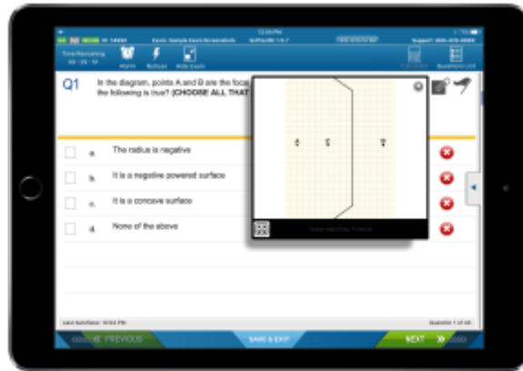
Image 2. A question attachment such as an image or diagram opens automatically when the question is opened. The image may obscure parts of the question text or answer choices, but it can be moved or closed and reopened as needed.

higher test scores. 19,21,24 However, we hesitate to assume these findings apply to SofTest-M exams because the process of scrolling on a computer is different than on a tablet. Scrolling through information on a computer screen involves a scroll bar, mouse wheel or page up/down keyboard keys. On a tablet, the students place their finger directly on the screen to move the content up or down to the desired location.