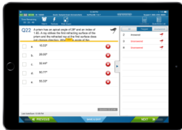
Image 1. For long questions or questions with many answer choices, students may have to scroll or adjust the window size to view all necessary information. On the right side of this screen, the Questions List is opened and showing all Flagged Questions from this exam.

Responses to the survey questions also emphasized the students' strong desire for scratch paper during exams. This was also one of the most commonly cited weaknesses of SofTest-M in the free-response section of our survey. This was likely due to the inability of SofTest-M to allow annotation and highlighting of questions and answer choices, a practice that students are accustomed to on pencil and paper exams. Blazer 23 discussed the importance of this feature in a 2010 report for Miami-Dade Public Schools and referred to the use of an electronic marker to highlight passages on computer-based exams. The ability to highlight words and phrases in the question stem was added to the software after our study was completed. Perhaps as the software matures more annotation features such as drawing and writing may be added, and scratch paper will become less of a demand.