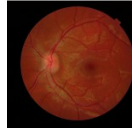
Figure 3B. Dilated fundus photography at the six-month follow-up visit at the eye clinic showed significant reduction of bilateral disc edema. Click to enlarge