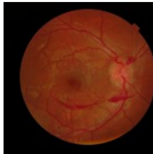
Figure 1A. Initial optometric examination revealed a pre-retinal hemorrhage OD.

A 22-year-old Hispanic male was referred urgently by a primary care physician concerning pain in the superior temporal side of his right eye that started eight days earlier. The pain was described as severe, sharp in quality and accompanied by photophobia. A few days after the onset of pain, the patient visited an ophthalmologist. The ophthalmologist diagnosed sinusitis, ordered a sinus X-ray and prescribed oral antibiotics. Per the patient, the result of the sinus X-ray was unremarkable. One day prior to visiting our clinic, the patient noted an acute drop in visual acuity in the right eye associated with the development of a “red central shadow.” No other visual symptoms were noted.