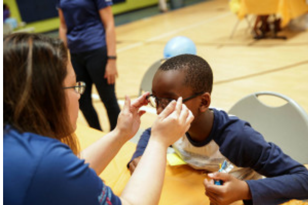
The partnership between National Vision and Boys & Girls Clubs of America benefits kids.