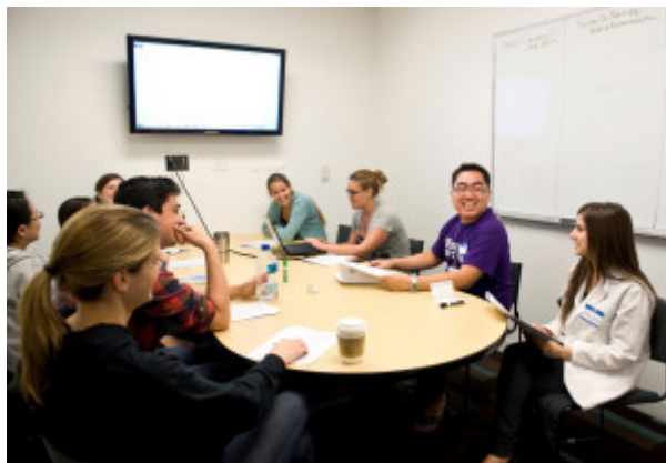
Photograph 1. An interprofessional small group meeting from IPE Phase I.