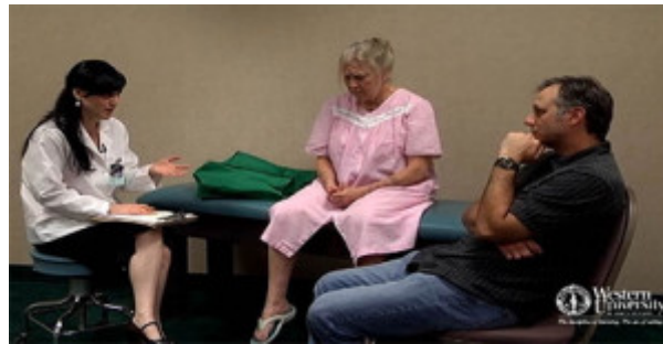
Photograph 2. A re-enactment of a standardized patient simulation from IPE Phase III.

Complementing the extensive student involvement in the IPE curriculum, all of the faculty members and administrators at the College of Optometry have been trained in IPE facilitation to support Phase I. Out of the entire College of Optometry faculty, 94% of faculty members have participated in at least one phase of the IPE curriculum. Development of facilitation skills is continuously supported, as exemplified by session briefings before each case and written facilitator information provided prior to each case session. In addition to facilitating for Phase I, College of Optometry faculty members also serve as case authors for Phase II, help design and evaluate case simulation sessions from Phase III ( Photograph 2 ), and provide guidance for the development beyond Phase III.