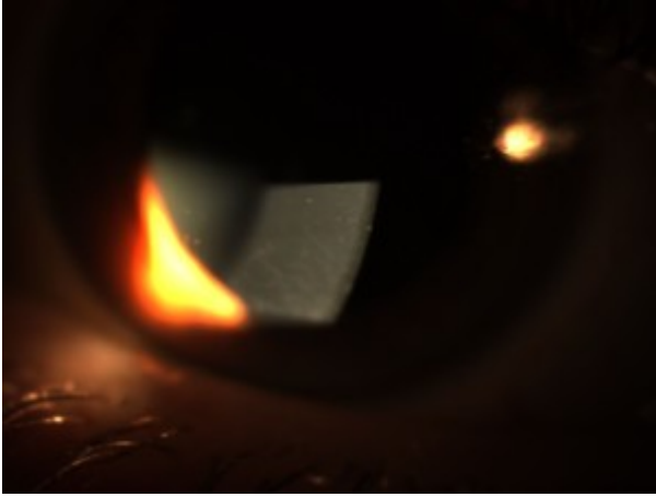
Figure 1A and 1B. Diffuse subepithelial map-like geographic patterns consistent with corneal epithelial basement membrane dystrophy.