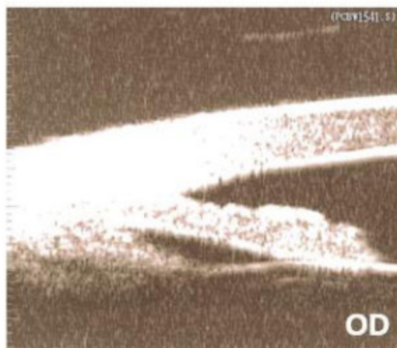
Figure 1. Ultrasound biomicroscopy of the right eye. Click to enlarge