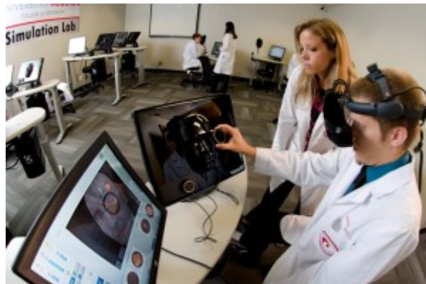
Image 1. A University of Houston College of Optometry student using the Eyesi Indirect simulator (VRmagic, Mannheim,

Virtual reality patient simulators are an appealing tool in education programs for medical professionals. Simulators provide an opportunity for increased training in risk-free environments, which may result in better patient outcomes as trainees transition from the laboratory to actual clinical care. With respect to surgical simulators utilized in ophthalmological training, virtual patient simulators have been well-accepted by trainees, 1 have been demonstrated to provide improvements in surgical outcomes in the operating room, 2-4 and have even been validated for the assessment of clinical competencies for surgical certification. 5